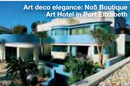
Art deco elegance: No5 Boutique Art Hotel in Port Elizabeth