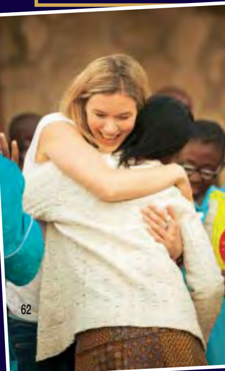
Joss greets staff at St Bernadette's (left) and leads a rendition of Newborn , with the children reading words from Braille song-sheets (below). Even Prince Seeiso (below right), who set up Sentebale with Prince Harry, joined in the dancing. "Music gives so much, it's completely unconditional," says Joss

teaches the national curriculum and basic life skills in a safe environment. They're reliant on Sentebale funds, not least for equipment like Braille machines and magnifying glasses. The women working here give the kids so much love – they're amazing. I've travelled a lot and you realise there's much more good than bad in this world, which is incredibly reassuring."